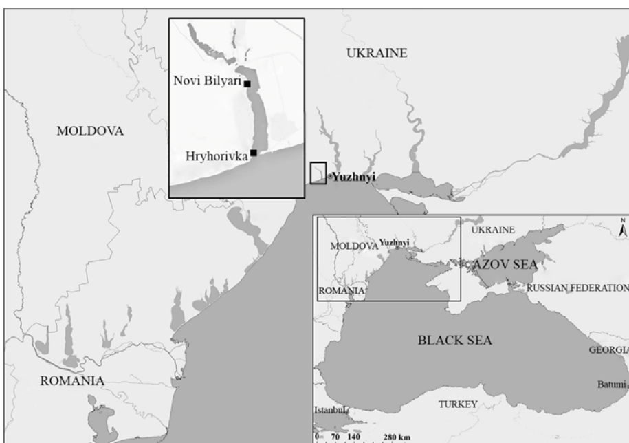
Fig. 1. Geographical location of Hryhorivsky Estuary.

The R software (R Core Team..., 2016) was used for the analysis and graphics.