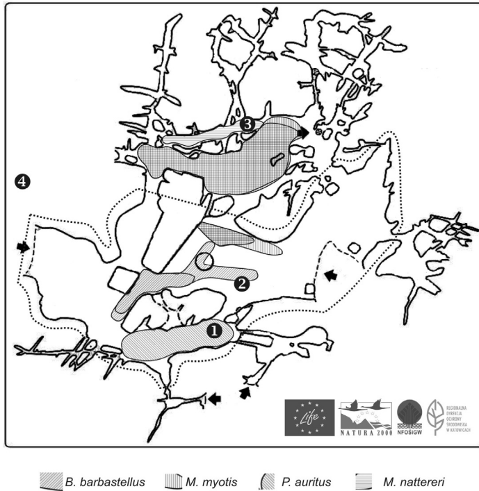
Fig. 1. The scheme of the Szachownica cave (after: Zygmunt, 2016).

Arrows – entrances, dashed line – the area with dynamic microclimate and under the threat of collapse.