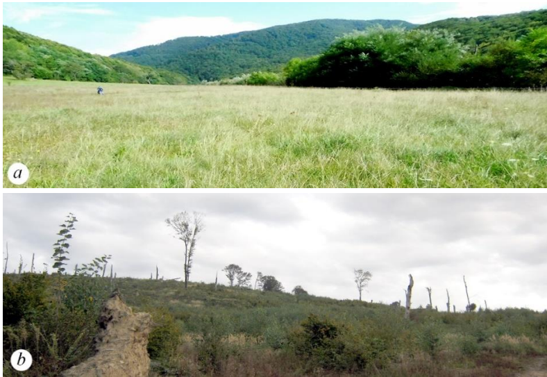
Fig. 2. Some of the studied habitats: a meadow within Uzhansky National Park (a) and a cleared windfall near Velykyi Bereznyi (b).

Рис. 1. Місця відлову дрібних ссавців в Ужанському національному парку та його околицях (Великобerezнянський район, Закарпатська область).