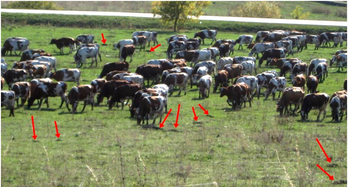
Fig. 5. Grazing of a herd of cattle on the Levzhenskiy site of the greater mole-rat's habitat (arrows show the mounds). Рис. 5. Випас стада великої рогатої худоби на Левженській ділянці оселища сліпака (стрілками показано сліпаковини).