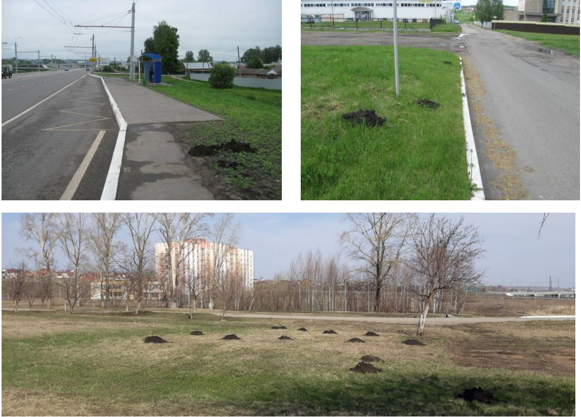
Fig. 4. Fresh mounds by the bus stop (a) and by the sidewalk (b), by the road in the village of Yalga (c). Рис. 4. Свіжі сліпаковини біля автобусної зупинки (a), тротуару (b) і автодороги в смт Ялга (c).