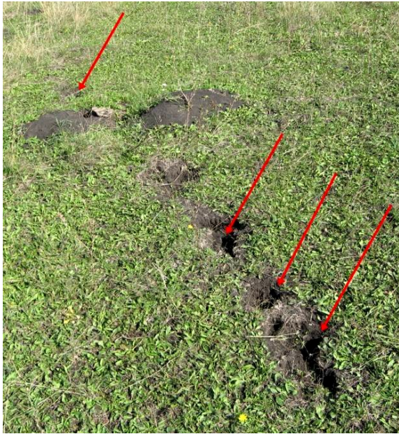
Fig. 6. Destroyed burrows of the greater mole-rat after grazing a herd of cattle (arrows show burrows after trampling by hooves).

Рис. 6. Знищені нори сліпака східного після випасу стада великої рогатої худоби (стрілками показано провали нір після витоптування копитами).