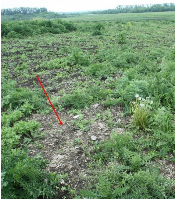
Fig. 3. The spots of clay soil on the plowed field are traces of the existence of mounds from the wintering chambers.