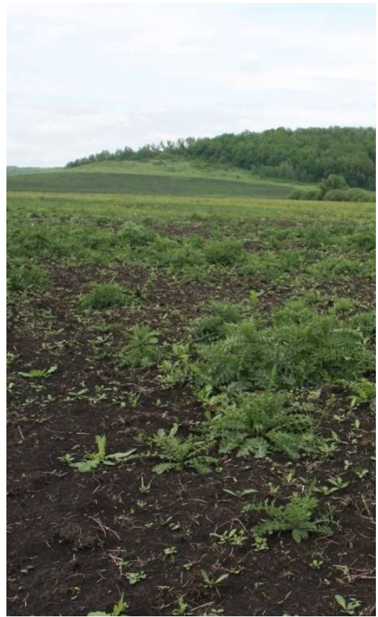
Fig. 2. Habitat of the greater mole-rat before plowing (2018) and after plowing (2020).