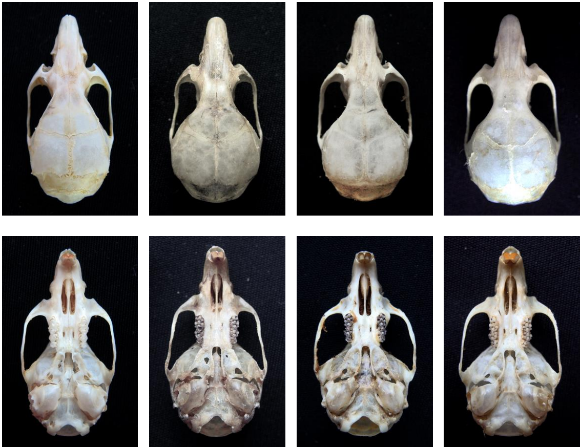
Fig. 2. Cranial features of Sylvaemus uralensis in comparison with morphologically similar species with which the former is often confused (left to right): Apodemus agrarius , S. uralensis , S. sylvaticus and S. witherbyi . The upper row shows skulls in dorsal view, while the bottom row shows them in ventral view.

The re-identification of materials from Podillia and adjacent regions of Ukraine presented in publications (especially in publications on owl pellets) as ' S. uralensis ' showed a number of incorrect identifications: skull fragments of Apodemus agrarius , Micromys minutus , and Sylvaemus sylvaticus are often diagnosed as S. uralensis . With the assistance of M. Drebet and I. Zahorodnyi, the author has revised the osteological materials based on which the species was mentioned earlier (e.g. Zaytseva & Drebet 2007; Shtyk & Zahorodnyi 2015), but recently it was not indicated for the same locations (e.g. Drebet 2011). In samples from more eastern regions (Azov Region and Crimea), this species is the most often confused with S. witherbyi and Mus musculus .