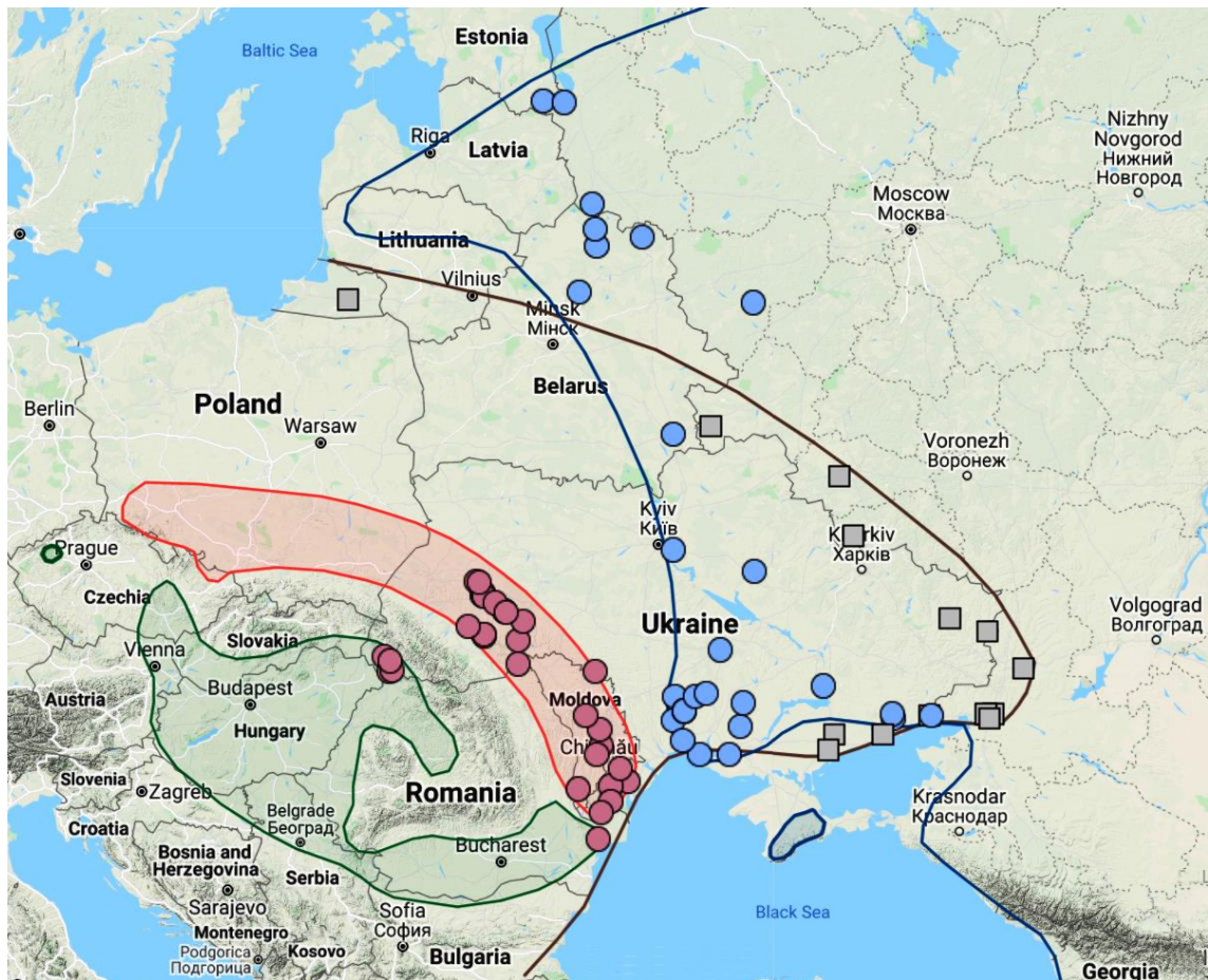
Fig. 3. The disjunct range of Sylvaemus uralensis , in Europe with three range fragments: Pannonian-Danubian (green), Carpathian (red), and East European (blue). The Crimean isolate (form baessleri ) was described earlier (Evstafiev 2015). Grey signs mark the eastern boundary of the geographic range of S. sylvaticus (after Zagorodniuk 1993, additions after Stakheev et al. 2011). Record localities of S. uralensis are given only based on materials personally verified by the author.

The species range is described here for its two main segments: western (range segments A1–A3) and eastern (range segments B1–B3) (Fig. 3), which corresponds to the respective taxonomic groups, i.e. the western to Sylvaemus uralensis microps and the eastern to S. uralensis (s. str.). There is a clear disjunction between these segments; marginal records are listed below.