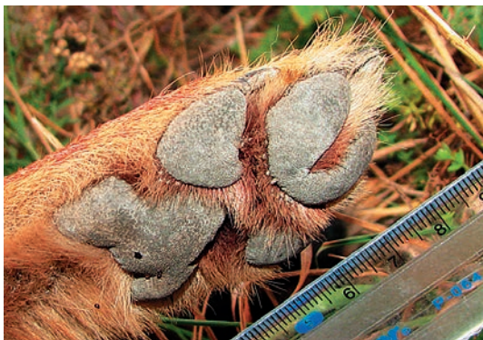
Fig. 2. Connate pads of the medial toes on the jackal's forelimb from the Donetsk Reg. Photo by Alexander Bronskov.

Рис. 1. Шакал, здобутий мисливцями у грудні 2009 р. на межі Хмельницької (с. Новокосянтинів) та Вінницької областей (с. Осічок). Фото Олега Гулька, 13.12.2012.