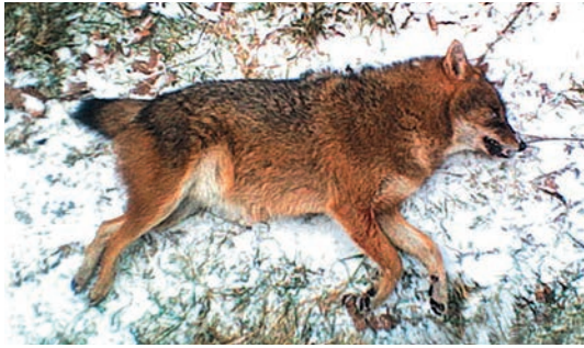
Fig. 1. Golden jackal killed by hunters in December, 2009 on the border between Khmelnytsky Reg. (vil. Novokostiantyniv) and Vinnytsia Reg. (vil. Osichok).

Рис. 1. Шакал, здобутий мисливцями у грудні 2009 р. на межі Хмельницької (с. Новокосянтинів) та Вінницької областей (с. Осічок).